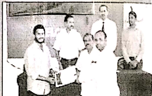
Distribution of certificates by the Resource person