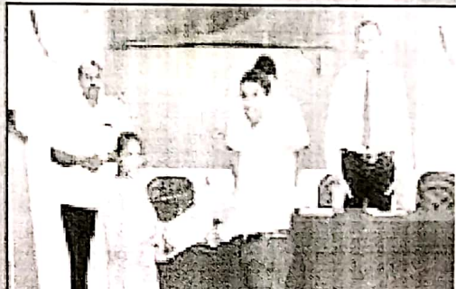
Distribution of certificates by the DSO