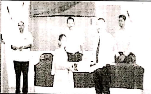
Distribution of certificates to the Dean-SoE