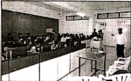
Students participating in the AutoCAD workshop